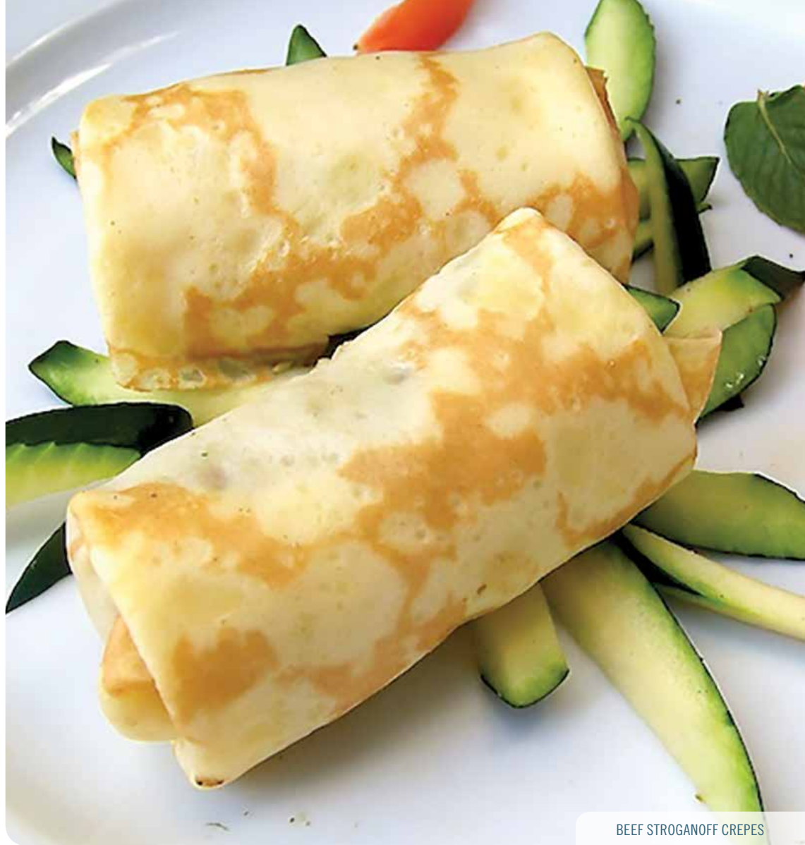
BEEF STROGANOFF CREPES

Bringing joy back to dining for individuals with physical and cognitive challenges.