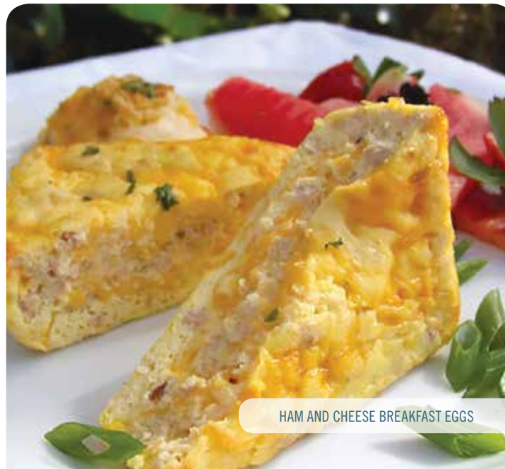
HAM AND CHEESE BREAKFAST EGGS