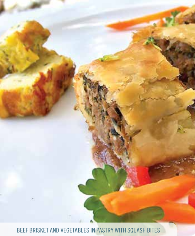
BEEF BRISKET AND VEGETABLES IN PASTRY WITH SQUASH BITES