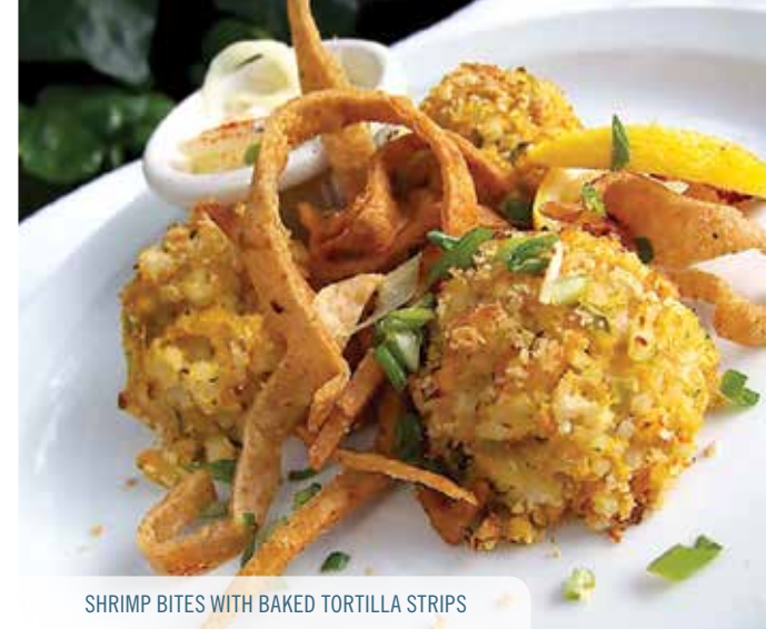
SHRIMP BITES WITH BAKED TORTILLA STRIPS